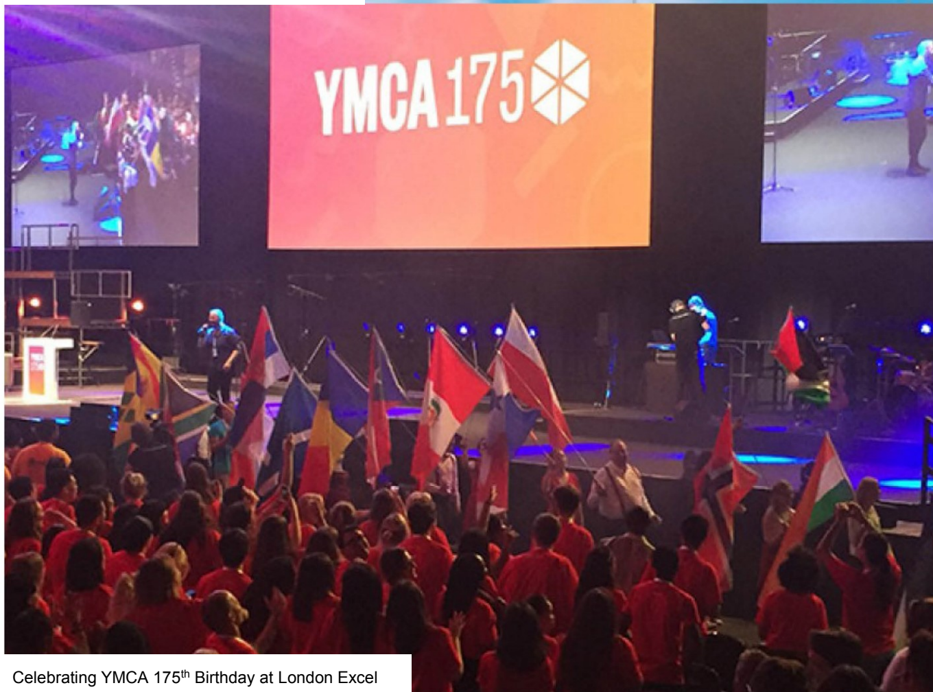
Celebrating YMCA 175 th Birthday at London Excel