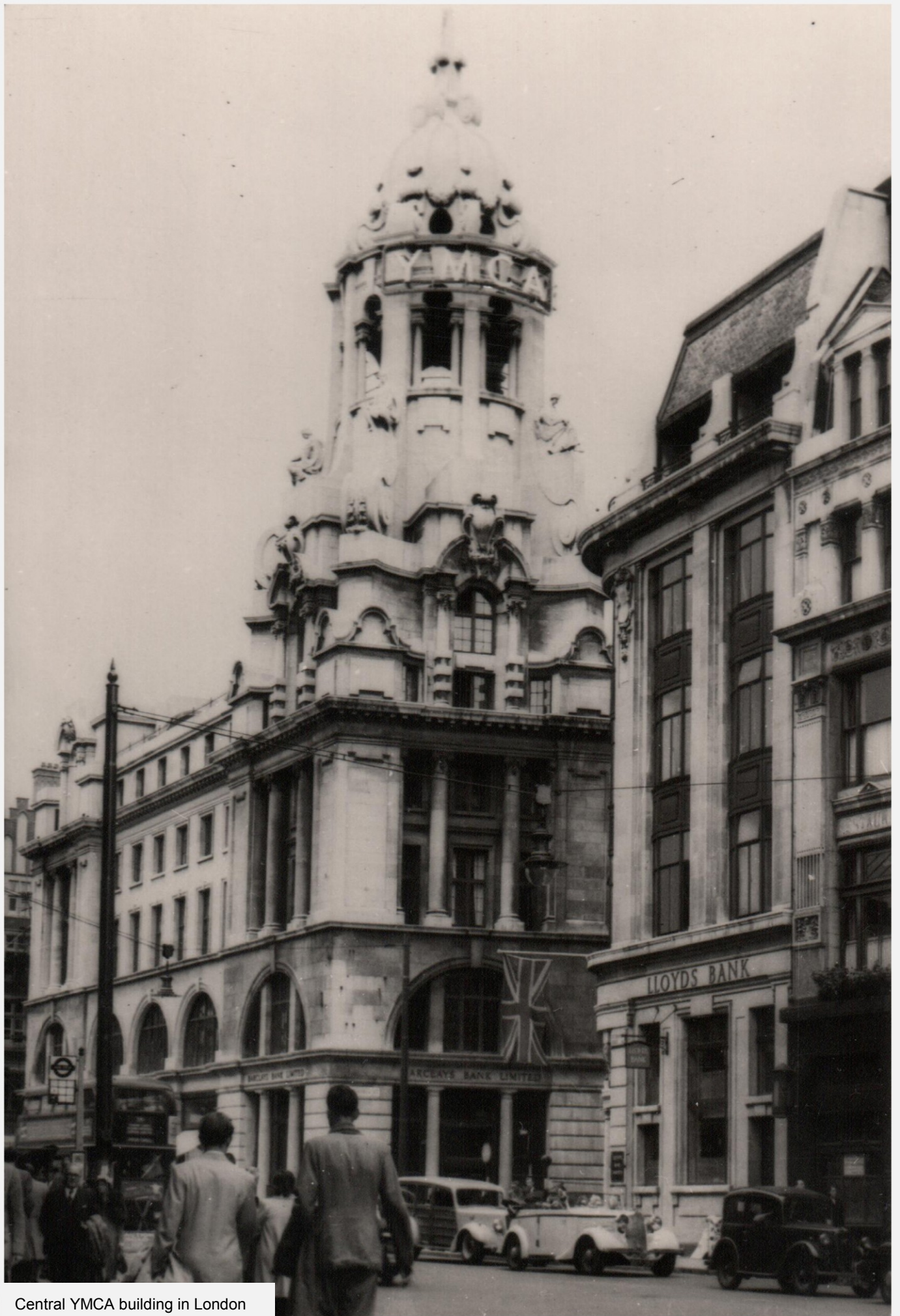
Central YMCA building in London