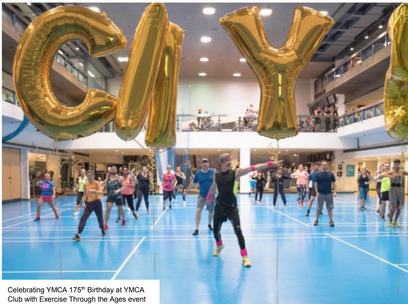
Celebrating YMCA 175 th Birthday at YMCA Club with Exercise Through the Ages event